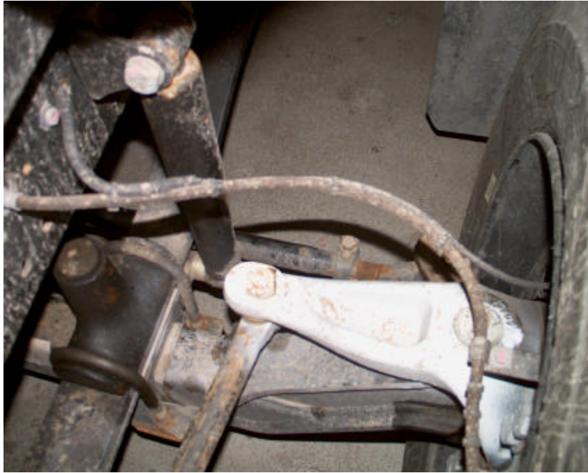
Correct Steering Arm Assembly shown above. Note: White paint indicates control arm has been inspected or replaced.