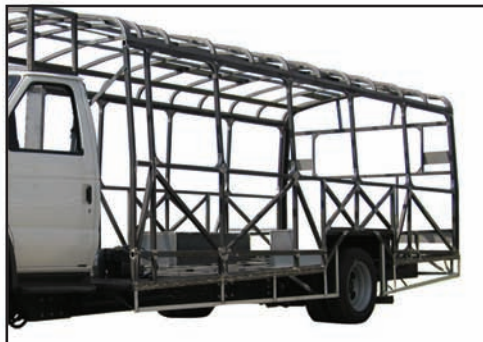
1½" x 1½" SteelGuard® construction provides superior durability.