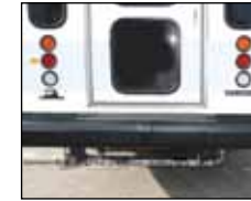
Rear Romeo Rim Bumper