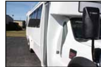
High Gloss Exterior Fiberglass