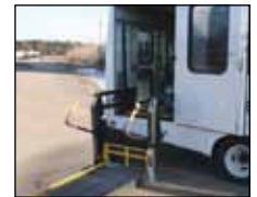
Rear Wheel Chair Lift