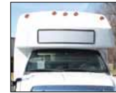
Front Cap with all LED Lighting