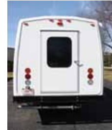
Rear Wall (shown with optional rear door & center brake light)

Due to constant product improvements; specifications, component parts and optional equipment are subject to change without notice or obligation. See your dealer for details. Photos may show optional equipment.