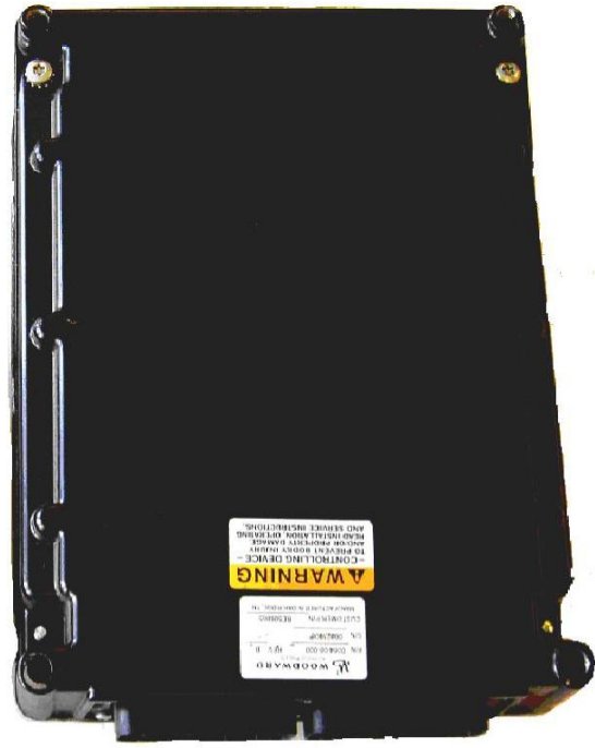
Newer version 1.2 Controller - Included in Recall