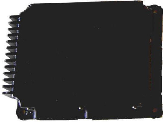
Older Version 1.1 Controller - NOT Included in Recall