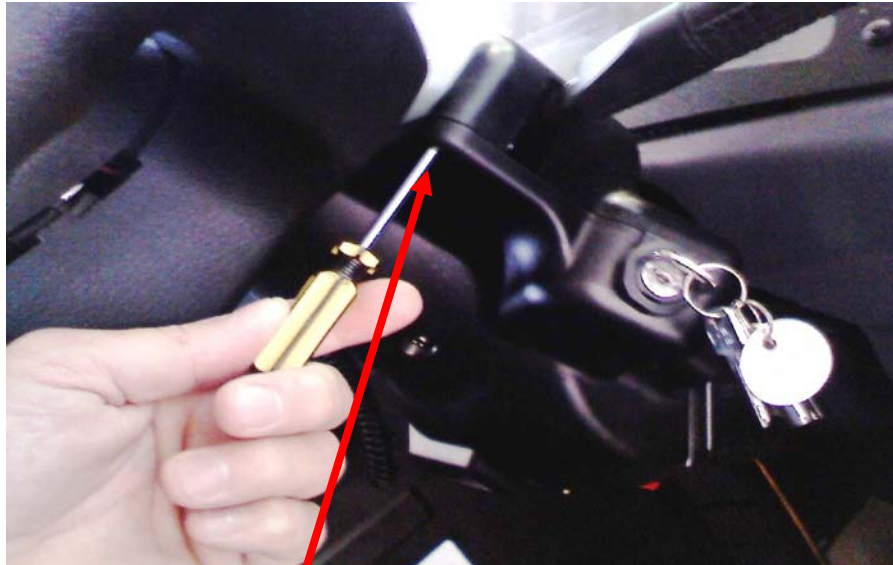
Torx T15 Screw Location