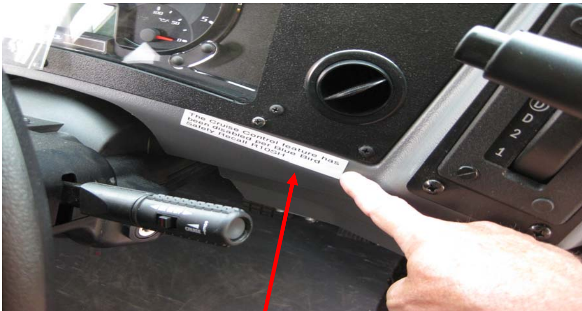
Decal Location on BBCV "Vision" Models