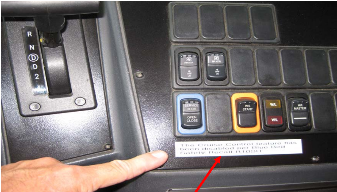
Decal Location on D3FE and D3RE All American Models