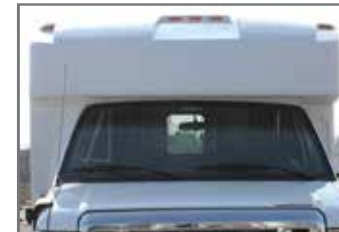
Recessed LED Clearance & Marker Lights