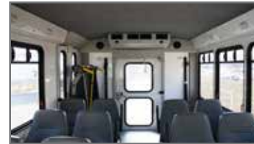
Spacious Interior Design

Due to constant product improvements; specifications, component parts and optional equipment are subject to change without notice or obligation. See your dealer for details. Photos may show optional equipment.