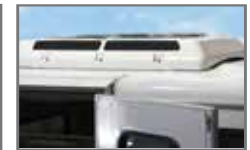
Rooftop Mounted AC