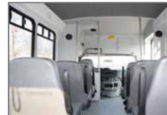
Stylish Coving with Integrated Dome Lights