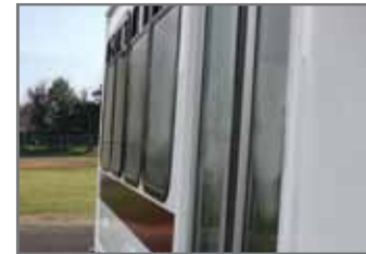
High Gloss Exterior Fiberglass