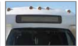
Front Destination Sign