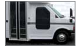
Transition Window (replaces co-pilot door)