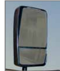
Breakaway Convex Mirrors

Due to constant product improvements; specifications, component parts and optional equipment are subject to change without notice or obligation. See your dealer for details. Photos may show optional equipment.