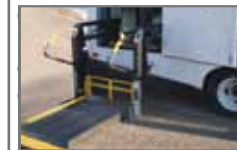
Rear Wheel Chair Lift