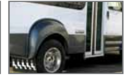
Painted Skirts and Black Out Windows